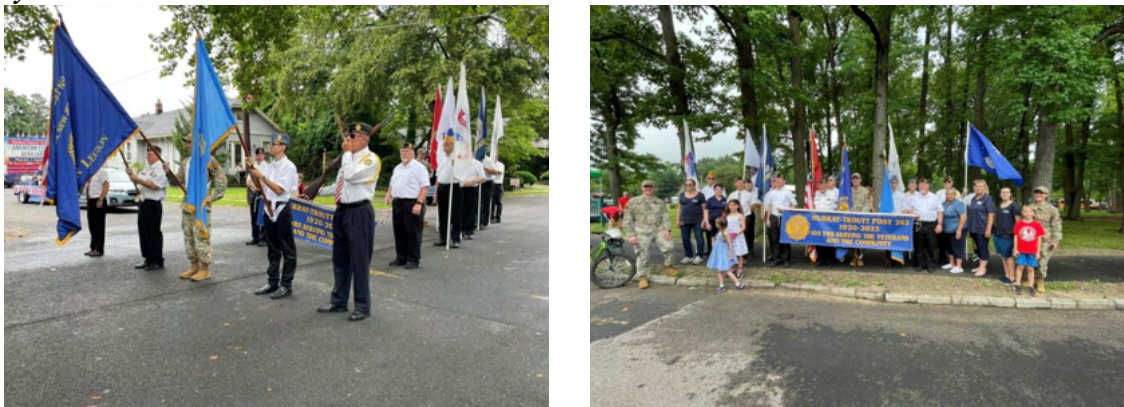
Murray-Troutt Post Family 262 in Audubon's 4 th of July Parade.