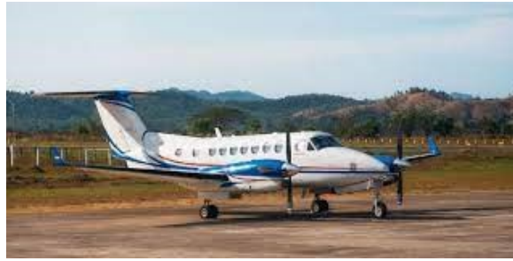
Unloaded and going back together.