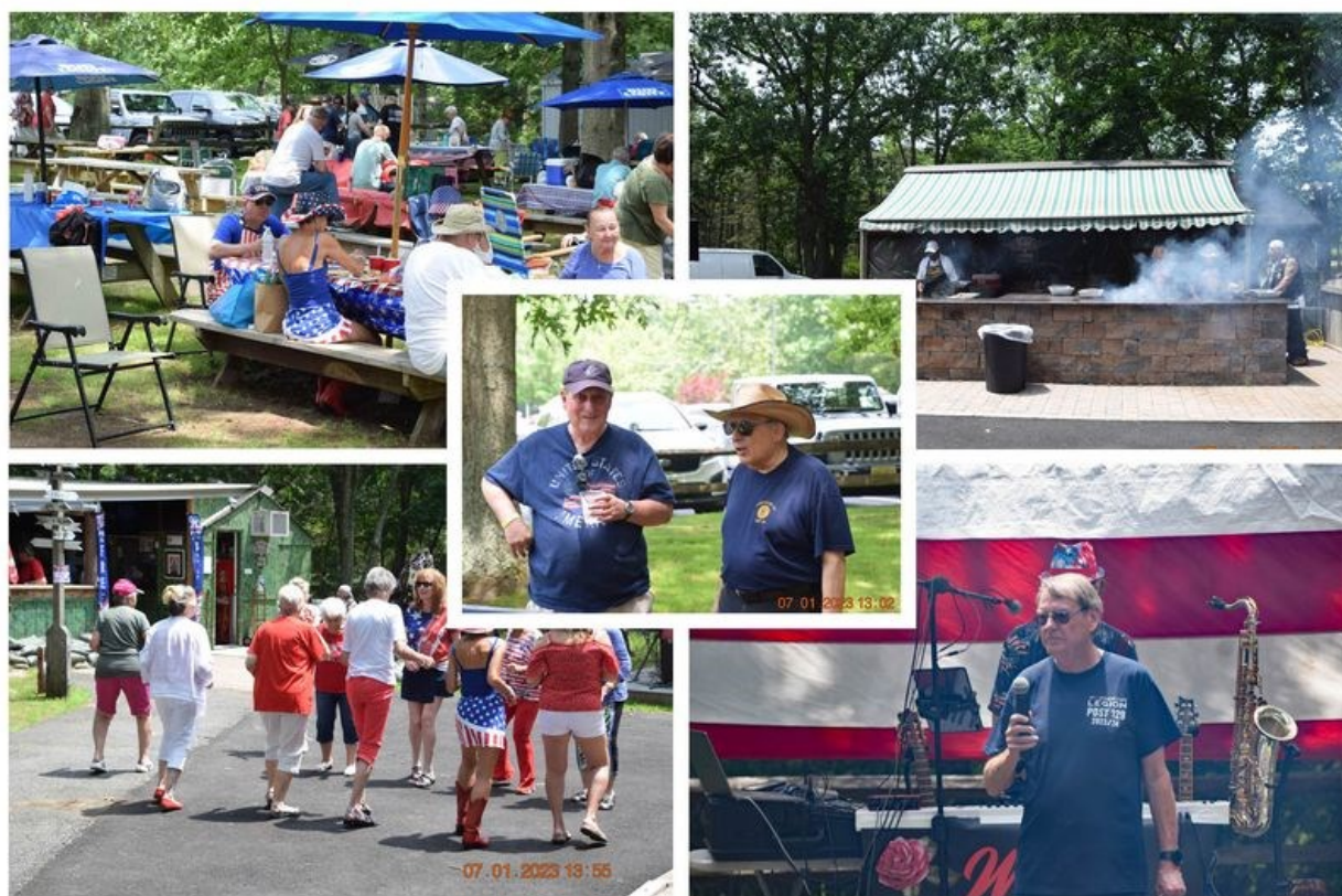
July 4 th at Toms River Post 129.