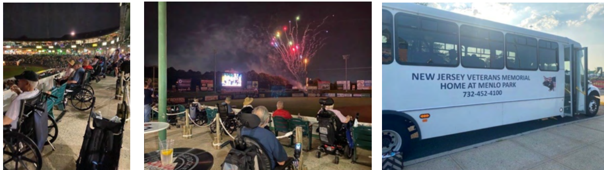
Eight Veterans and four Staff from Menlo Park Veterans Memorial Home were our guests at the game.