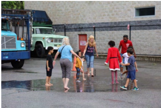
Puddle? Did someone say Puddle???