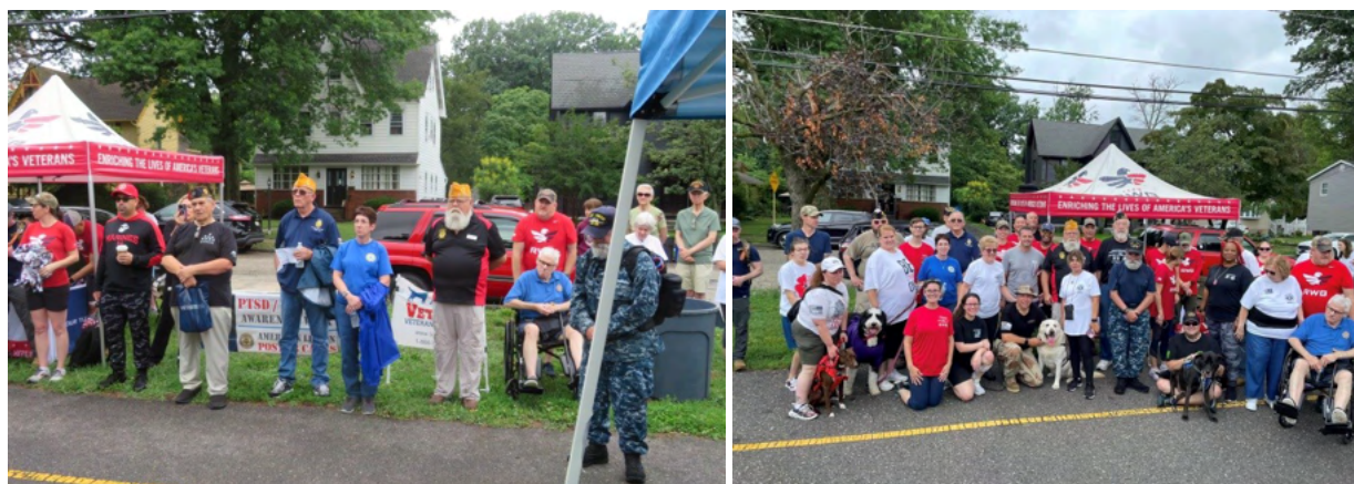
(Left) Marchers listen to remarks about the Walk.