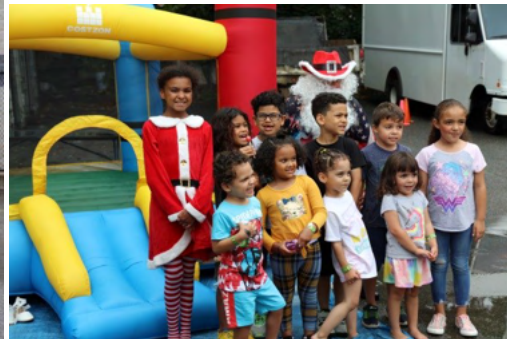
Santa and some of the kids.

Here are just a few pictures of our American Legion 105 Family 'Christmas in July' event on July 16th. Through this event, we raised thousands of dollars to fund our Christmas Coat and Toy Drive, helping out local families and doing our part to help make a #BetterBelleville . Thank you to all the vets, Sons, ALA's, and friends who took part in everything from the planning, fundraising, and execution of the event. Job well done! (See the whole picture collection on SAL 105's Facebook page: https://www.facebook.com/SAL105NJ )